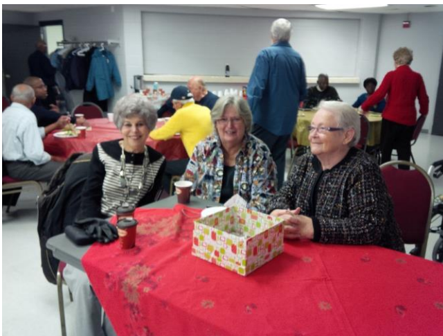
Welcome to Our Meeting