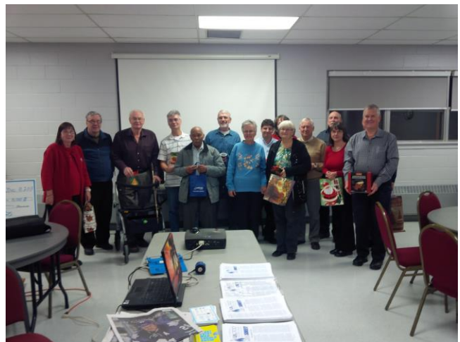
The Door Prize Winners